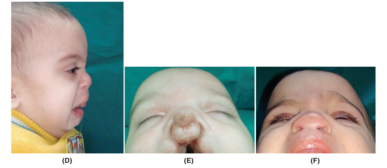
Fig. (2): (A) Front view of a six-month-old male with bilateral complete cleft lip & palate & severe protrusion of the premaxilla. (B) Six months post demonstrating adequate tip production. (C) Same patient's profile view at six months of age with nasal tip appear attached to the prolabium & almost no columella is seen. (D) Six months post with adequate tip projection & columellar lengthening utilizing an open tip-plasty at the time of cheiloalveoloplasty. (E) Base view demonstrating the severely protruding premaxilla away from the two lateral segments and (F) The restored nasal harmony at six months post with the apparent widening of the columella.